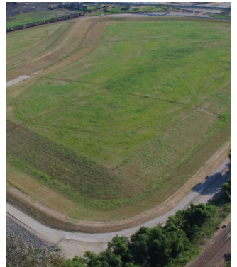
This Ash Basin At The Meramec Energy Center Closed In The Spring Of 2018.

The ash will be compacted, graded and sloped to permanently shed water. After that, an engineered capping system, far stronger than regulations require, will be constructed over the top of the basins and the river-side embankment walls armored with rock. This system will take approximately two years to construct and isolates the ash from infiltration. Precipitation will be routed to newly-constructed storm water basins. The limited groundwater impacts localized to our property will diminish over time, and experts are evaluating methods to accelerate this process.