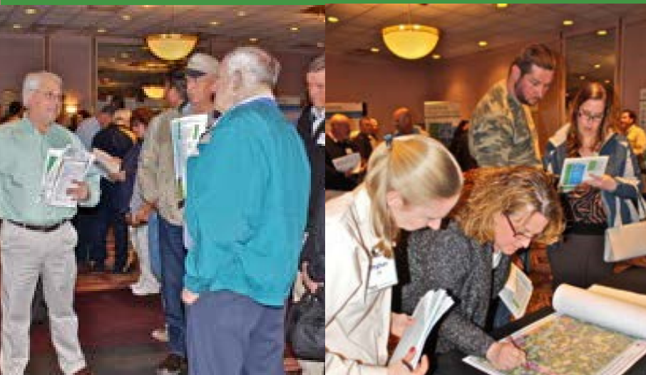
Knox County open house participants learning about the project