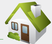
Customer Electric Usage